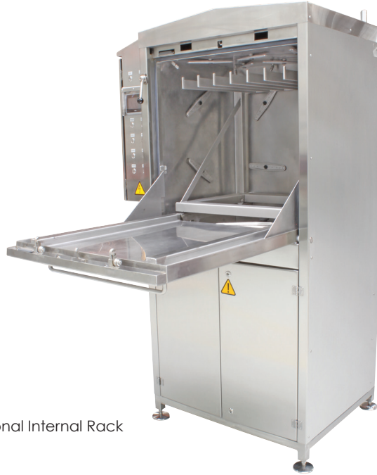
Shown with optional Internal Rack

For cleaning and sanitizing knives, metal mesh gloves, sharpening steels and a host of other items