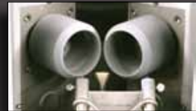
Hollow grinding wheels