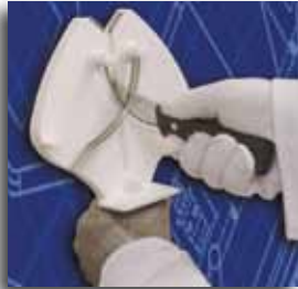
Use hand-held, right or left handed

Requires no training to use, the Ergo Steel III can be held comfortably and safely, right- or left-handed. The Ergo Steel III's handle can be effortlessly placed into the optional stainless steel bracket for bench-mount use.