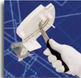
Bracket installed for use at elevated height