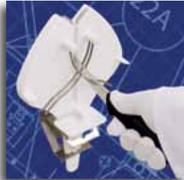
Bracket installed for use at work table height