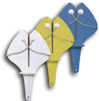
Available in white, yellow or blue